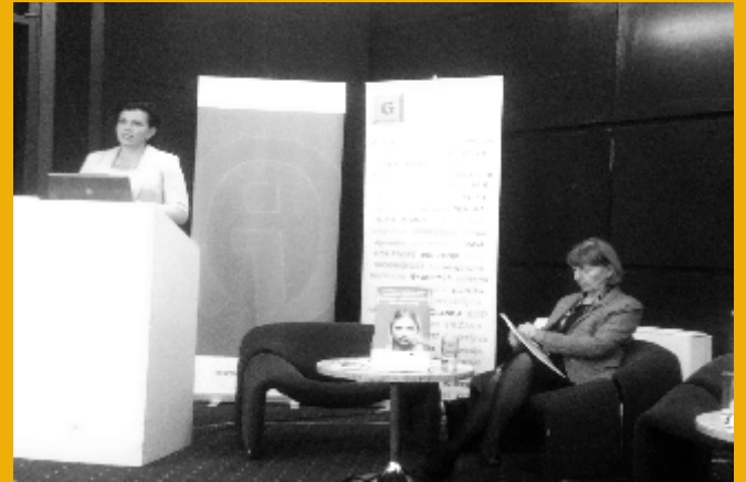
The Second Debate Forum of women candidates from Election Lists of the General Elections, Sarajevo

The purpose of "Legal Assistance to Women Candidates in the October 2018 General Elections" is the protection of women's rights in the politics of Bosnia and Herzegovina, as well as an increase in legal protection in case of violation of their electoral rights, before and after elections.