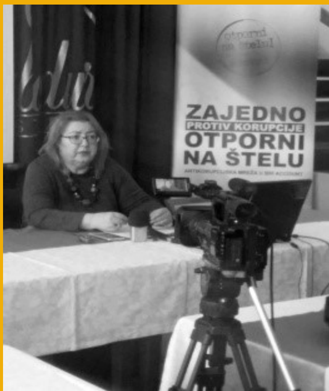
Zenica Press Conference

Within the " Equal Opportunities - Transparency in Employment in the Public Sector III " project, the Helsinki Committee for Human Rights drafted an analysis of legislative framework in the field of employment in the public sector covering seven Cantons of BiH ( Posavina, Bosanai-Podrinje, Tuzla, Middle Bosnian, Zenica-Doboj, Una-Sana, and Canton 10 ). In order to present the findings of the analysis, a press conferences were held in the mentioned cantons in September. The conferences were attended by representatives of the cantonal anti-corruption teams, civil society organizations, the media and representatives of local governments.