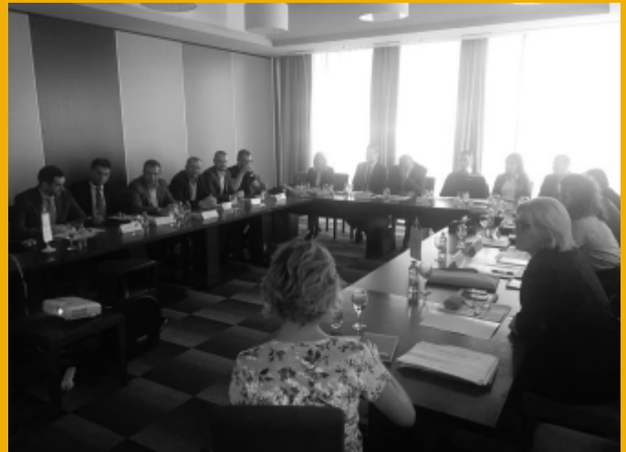
Account's educational program

, 778: * < 216 + . ? .. 6 * , , 7 - 6 * 6 3 , < 2 . 8 7 3 , <