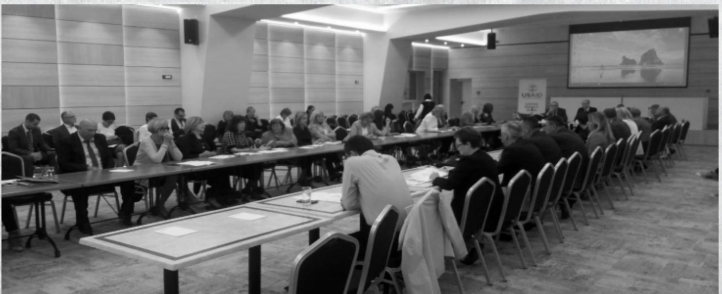
In cooperation with the Justice project, ACCOUNT participated in the XI Expert Conference of Prosecutors in Bosnia and Herzegovina, taking part in the Corruption, Economic and Organized Crime Panel . The conference was held on October 2 and 3, 2018 in Neum.

, 778: * < 216 + . ? .. 6 * , , 7 - 6 * 6 3 , < 2 . 8 7 3 , <