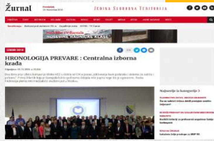
Anticorruption news from ACCOUNT's partners