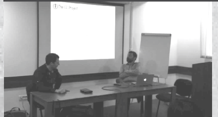
Data security training

CRMA, which is coordinating ACCOUNT's media component activities, organized training with the media and journalists on digital security. The training "Digital Security Awareness" for the ACCOUNT media pool members was delivered in cooperation with the project "Information, Safety, Capacity" (ISC). Safer communication, social networks and digital security of mobile data – were the key topics discussed during this training in Banja Luka, January 10, 2018.