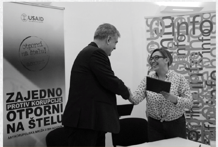
Bihac signing ceremony

Total of 28 municipalities have signed the Memoranda of Understanding on development of anti-corruption actions plan at the local level. Once developed, these plans should contribute to higher transparency of budget spending, better organization of the work; decline of local administration abuses, but also to improvement of the general living conditions of citizens.