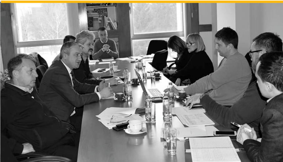
Meeting with anti-corruption caucus of the RS NA, Banja Luka, September 5, 2018

The ACCOUNT representatives attended the session of the anti-corruption caucus (PAK) of the National Assembly of Republika Srpska that was held on February 5, 2018 in Banja Luka. The interlocutors discussed realization of the RS Anti-Corruption Strategy 2013-2017, draft Strategy for the period 2018-2020, and PAK's plan of activities in the forthcoming period. The session was an excellent opportunity for exchange of experiences, and more detailed familiarization of PAK members with the ACCOUNT's activities.