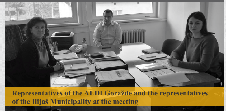
Representatives of the ALDI Goražde and the representatives of the Ilijaš Municipality at the meeting

The self-assessment questionnaires were completed in Breza and Ilijaš municipalities in January 2018. The qualitative and quantitative analysis of the self-assessment of local administration on anti-corruption initiatives and transparency for Breza and Ilijaš municipalities were prepared in line with the completed questionnaires.