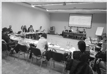
Meeting with the Working Group in Konjic, January 23-25, 2018.

Strengthening of the BiH Public Procurement Law is still in the focus of ACCOUNT's attention. In partnership with Transparency International, Open Society Fund and Tender, ACCOUNT defined the priority areas of this Law that must be improved for establishing a transparent and more responsible public procurement system. For that, ACCOUNT has continued an intensive cooperation with the BiH Public Procurement Agency, and has initiated a dialogue with the Working Group of the BiH Council of Ministers, which is currently leading the process of amending the Public Procurement Law. ACCOUNT's proposals for advancing the legal framework were discussed at the three-day meeting that the Working Group held in Konjic, January 23 - 25, 2018.