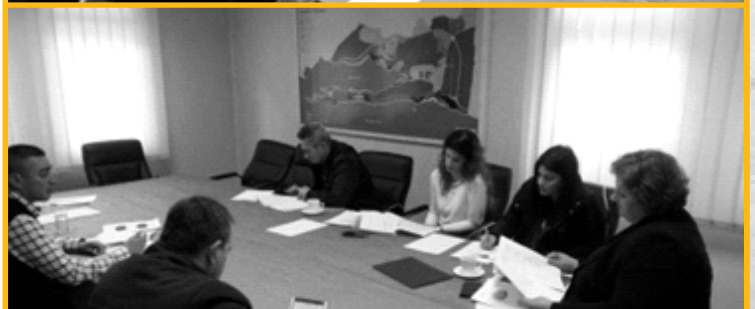
Anti-Corruption training, Neum