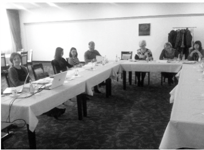
Expert discussion - ZDK

ACCOUNT in partnership with ICVA from Sarajevo and the Anti-corruption Team of the Zenica-Doboj Canton Government organized an expert discussion on development of a Rulebook for prevention of corruption in the public healthcare institutions in Zenica-Doboj Canton. The representatives and anti-corruption coordinators of the public healthcare institutions in Zenica-Doboj Canton attended the discussion. The participants of the discussion have in principle accepted the draft model of the rulebook, which they will work to adapt to the internal organization within their institutions and additionally discuss within the Zenica-Doboj Canton Government's Anti-corruption Team by the end of March 2018, preferably. The discussion is a part of the initiative and joint action of the relevant institutions, agencies and civil society organizations on the improvement of institutional system for prevention of corruption in the healthcare sector.