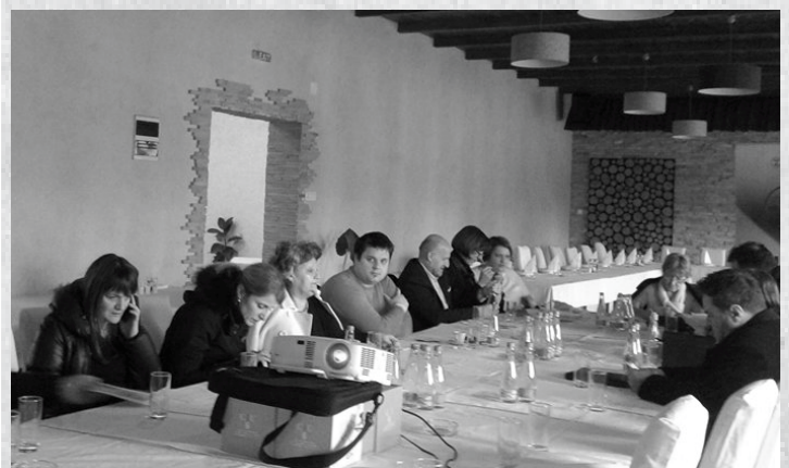
Anti-corruption Action Plans - workshop

It was concluded that the budget drafting process has to be improved, citizens have to be motivated to get more actively involved in the public discussions, and the documents that are well understandable to citizens have to be prepared.