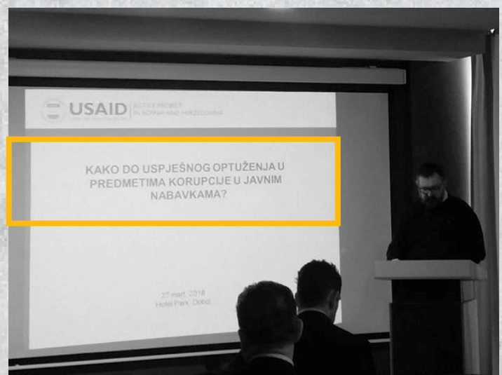
ACCOUNT Media pool

Within the five-month funding cycle, a total of 10 media from Bosnia and Herzegovina, members of the ACCOUNT Media Pool, will be supported. During this period, the media will pay attention to the development of content in the field of investigative journalism in the project areas, raising public awareness of the problem of corruption and empowering anti-corruption initiatives.