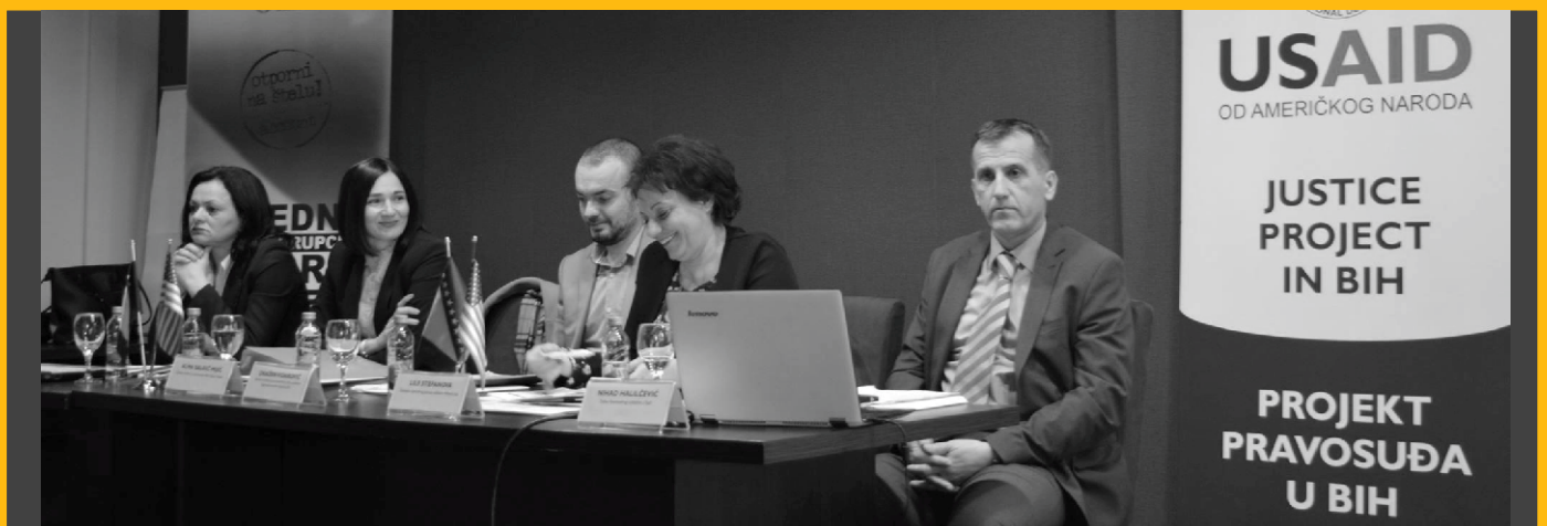
Education for judges and prosecutors from Bosnia and Herzegovina, Doboj

On March 27 and 28, 2018, Education for judges and prosecutors from Bosnia and Herzegovina in the field of public procurement was held in Doboj. The training was organized by USAID's projects - Justice Project in BiH and ACCOUNT in tandem, as well as with the entity - level Education Centers for Judges and Prosecutors. Through the lectures on "Public procurement in BiH - Identification of corruption in public procurement", judges and prosecutors had the opportunity to learn how to achieve successful accusations in cases of corruption in public procurement, what are the indicators and the most common forms of corruption, and what the priorities in the investigations are. Representatives of the Public Procurement Agency of BiH, the Office for the Review of Appeals, prosecutors of the Special Prosecution Office of Macedonia and the judges of the Supreme Court of Cassation from Serbia took part in the training.