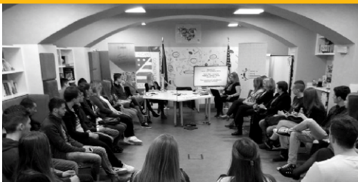
Anti-Corruption Youth Forum Held