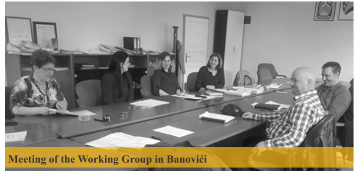
Meeting of the Working Group in Banovići

In March, the third meeting of the Working Group in the Banovići Municipality was held, where the preparation of the Action Plan for the Prevention of Corruption is in the final stage.