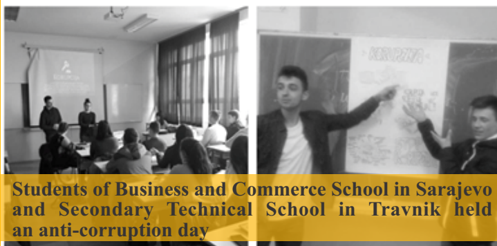
Students of Business and Commerce School in Sarajevo and Secondary Technical School in Travnik held an anti-corruption day