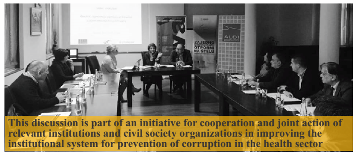
This discussion is part of an initiative for cooperation and joint action of relevant institutions and civil society organizations in improving the institutional system for prevention of corruption in the health sector

On that occasion, ICVA presented a draft of a rule book / policies and procedures for the prevention of corruption in health institutions in Sarajevo and Zenica-Doboj cantons. During the discussion, the participants had the opportunity to provide suggestions and proposals in order to get acquainted with the advantages of introducing such a rulebook.