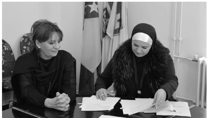
Signing on the Action Plan, Visoko

After completing the quantitative and qualitative analysis of the self-assessment of the areas that are exposed to corruption and workshops on the preparation of action plans for the fight against corruption based on the analysis, the Working Groups of the Travnik and Žepče municipalities have started the preparation of the Action Plans, while Visoko is the first municipality in 2018 that adopted the Action Plan for Prevention of Corruption. The consequences of corruption in practice include poor public services, increased social polarization, inefficiency in public services, low investment in the municipality, reduction of economic growth, inadequate treatment of citizens by municipal officials. Although there is no a unique recipe for combating corruption at the local level, the development of anti-corruption action plans has proven to be a good preventative format.