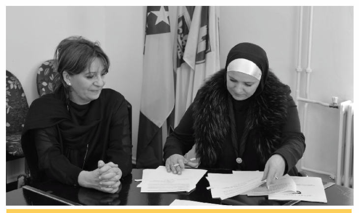
Signing on the Action Plan, Visoko

After completing the quantitative and qualitative analysis of the self-assessment of the areas that are exposed to corruption and workshops on the preparation of action plans for the fight against corruption based on the analysis, the Working Groups of the Travnik and Žepče municipalities have started the preparation of the Action Plans, while Visoko is the first municipality in 2018 that adopted the Action Plan for Prevention of Corruption. The consequences of corruption in practice include poor public services, increased social polarization, inefficiency in public services, low investment in the municipality, reduction of economic growth, inadequate treatment of citizens by municipal officials. Although there is no a unique recipe for combating corruption at the local level, the development of anti-corruption action plans has proven to be a good preventative format.