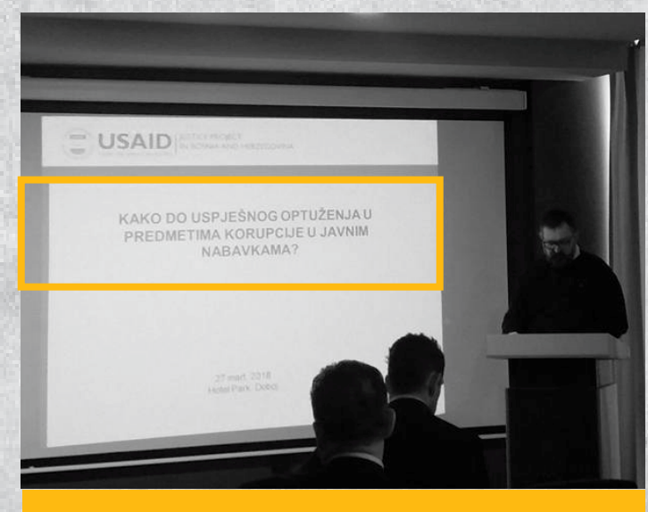
ACCOUNT Media pool

Within the five-month funding cycle, a total of 10 media from Bosnia and Herzegovina, members of the ACCOUNT Media Pool, will be supported. During this period, the media will pay attention to the development of content in the field of investigative journalism in the project areas, raising public awareness of the problem of corruption and empowering anti-corruption initiatives.