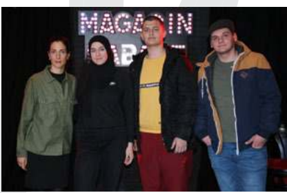
Stand up performance winners, Sarajevo in December 2019.